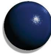
BL467 Dark Blue Hammer-tone Semi-Gloss