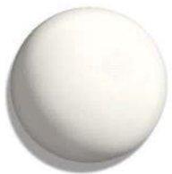
WH260 White Hammertone Semi-Gloss