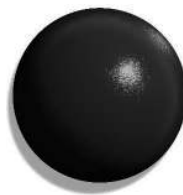
BK62 Black Hammertone Semi-Gloss