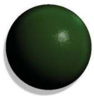
GN220 Green Hammertone Semi-Gloss