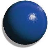
BL468 Blue Hammer-tone Semi-Gloss