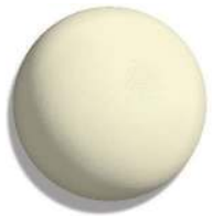
BG38 Beige Hammertone Semi-Gloss