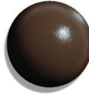
C012 - BR376 Chestnut Hammer-tone Semi-Gloss