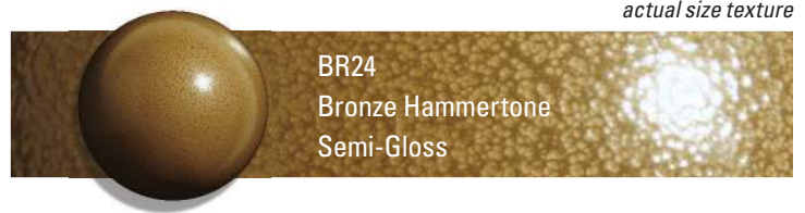
BR24 Bronze Hammertone Semi-Gloss

See reverse for additional available Standard Color finishes.