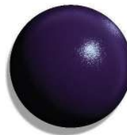
C013 - PL92 Plum Hammer-tone Semi-Gloss