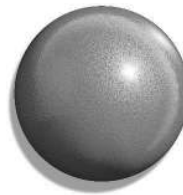
GR05 Silver Hammertone Semi-Gloss