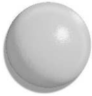
GR1389 Gray Hammer-tone Semi-Gloss