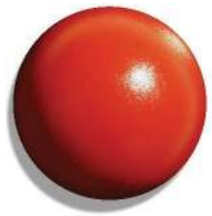
RD15 Red Hammertone Semi-Gloss